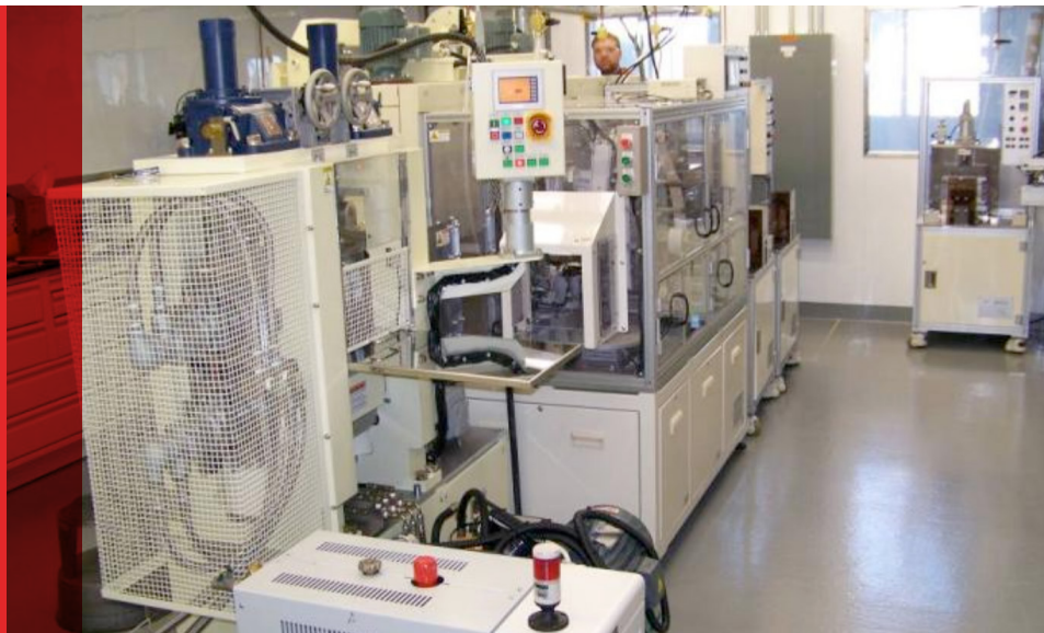
Cell production equipment in dry room