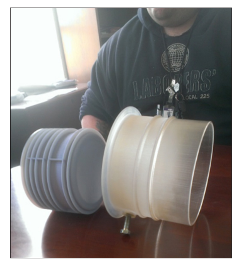
CURLS prototype tunnel port and cartridge

The novel CURLS continuous sleeve ring revolutionizes material transfer in and out of gloveboxes. All CURLS resource cartridges are designed to break into several pieces so that used cartridges can be easily removed from the glovebox via "bag-out" so that used cartridges do not clutter the work space.