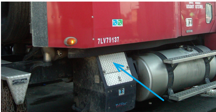
A truck equipped with an APU. APUs provide power for climate control and electrical devices.