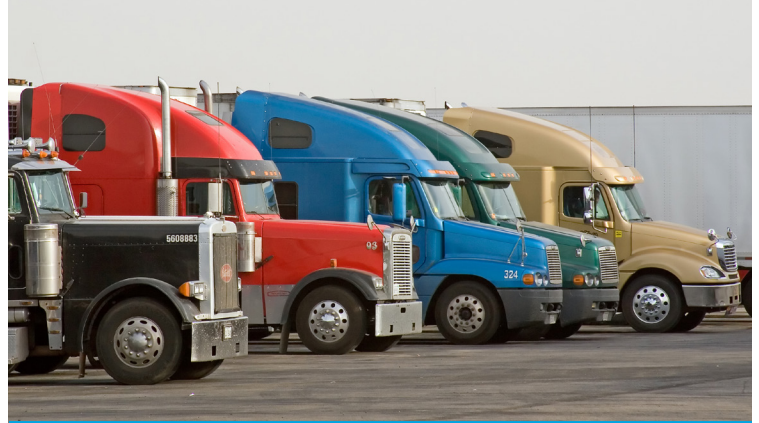
A long-haul truck idles about 1,800 hours per year for rest periods alone.

Many state and local laws restrict the idling of heavy-duty trucks, and violating idling laws can result in steep fines. Clean Cities' IdleBase ( cleancities.energy.gov/IdleBase ), a database of idling laws and ordinances, catalogs known idling restrictions and penalties for all classes of on-road vehicles. The American Transportation Research Institute ( atri-online.org ) provides a downloadable cab card for laws specific to heavy-duty trucks.